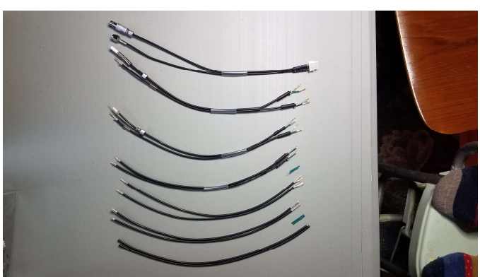
NPS HV diverter cables