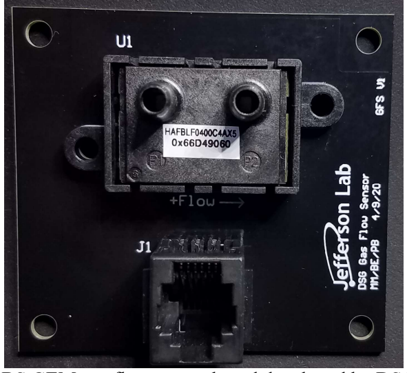
SBS GEM gas flow sensor board developed by DSG